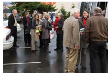
Whatcom County Philanthropy Day Supporters