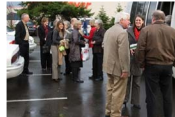
Whatcom County Philanthropy Day Supporters