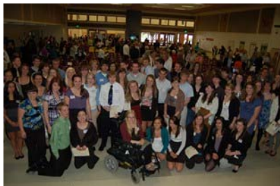
2011 BDFS Scholarship Recipients

BDFS volunteers along with Foundation Board members and staff recognized 90 outstanding students and awarded more than $78,000 to Bellingham School District seniors on May 31st.