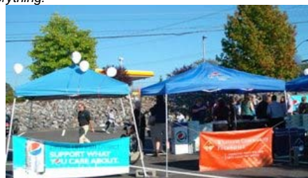
Refresh Awards September 14, 2010

Walton Beverage and Whatcom Community Foundation were so impressed with the community engagement and the projects seeking funding that more money was added to the fund! Awards totaled $36,000 and benefited more than twenty organizations. To read about the award winning projects click here .