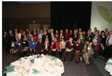
Whatcom Contingent of the 2009 National Philanthropy Day Celebration

submitted by the Lummi Nation and the Whatcom Community Foundation with nomination submitted by the St. Luke's Foundation! We will be chartering a bus with the St. Luke's Foundation, leaving that morning from Bellingham at 8:30am and returning by 4pm with a celebratory toast. (The Philanthropy Awards will be from noon to 1:30pm.) If you haven't already, email rsvp@whatcomcf.org to pre-reserve your seat on the bus and/or the celebration.